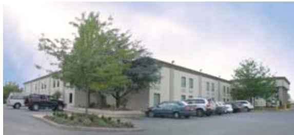
Clarion Hotel & Conference Center 901 Dual Highway, Hagerstown, MD, US, 21740