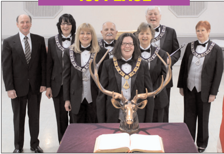
DOVER LODGE #1903