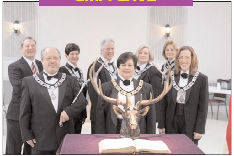
NEWARK LODGE #2281