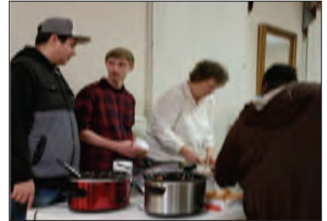
Two teenage area boys who volunteered to help with one of our newest members

The Seaford Elks lodge #2458 members have been working in conjunction with the Code Purple homeless shelter in Seaford, DE. On January 24th, ten members of our lodge provided and served soup, biscuits and cookies to about 18 homeless people at the shelter. They were also given a backpack containing a blanket, towel, wash-