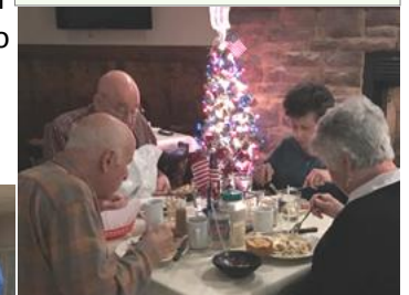
Veterans Dinner held at Pocomoke Elks Lodge to honor the 245th