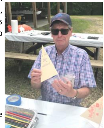
John prepares to sail away into the sunset

"The past can not be changed. The future is yet in your power!"-Unknown