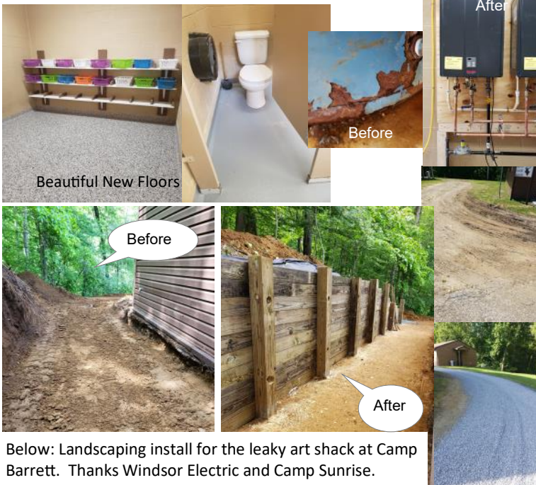
Below: Landscaping install for the leaky art shack at Camp Barrett. Thanks Windsor Electric and Camp Sunrise.