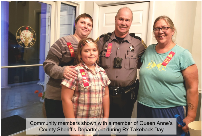
Community members shown with a member of Queen Anne's County Sheriff's Department during Rx Takeback Day

Kent Island Elks #2576 was the number one collector of used and unwanted medications in the month of October and took in 141 pounds of medication to be responsibly disposed of. KI Elks Lodge took in more than the Kent Island Fire Company! Nice work, Kent Island Elks DAP (Drug Awareness Program).