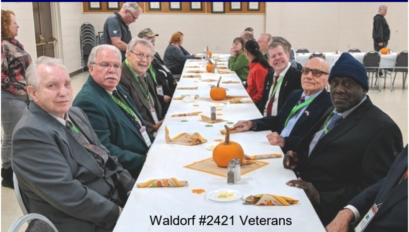
Waldorf #2421 Veterans