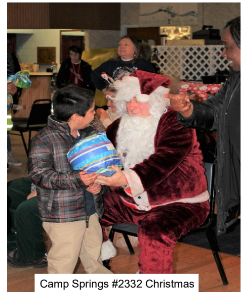
Camp Springs #2332 Christmas

Our State Association Skilled Trades Scholarship applications have been available since November 1, 2019, on the state web site. To access the application, please go to www.mddedcelks.org/scholarship.html . Then go to Committees M – Z (Scholarships) and then scroll down to Skilled Trades Scholarships. The guidelines and application are available there. The deadline for application submission is April 15, 2020.