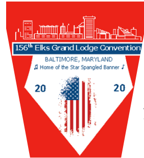
Janie Swigert Volunteer Vest Kent Island Lodge