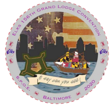
Connie Frere Pin Design Kent Island Lodge