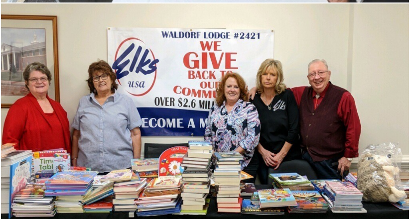
Waldorf Lodge #2421 Baby Shower