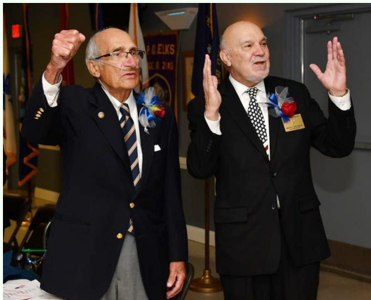
Veterans Day at Cape Henlopen

Veterans receiving banner from Hometown Hero's Boardwalk display— Ocean City Lodge