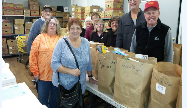
Members of Dover Lodge #1903 prepared holiday meal bags for 20 needy families for Thanksgiving and Christmas, thanks to a Gratitude Grant.

IT'S THE FUTURE OF YOUR LODGE. We as the great Elks, need all the best and I believe it starts with "you," great Elks. There is a verse I would like to share, "If you get out there and you're liked, others will want to be like you." I have heard someone likes that too. With that said, I will be looking forward to seeing everyone in the future of my travels in Elksdom. Have a safe and happy journey.