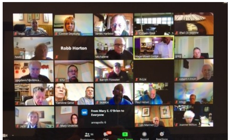
Winter Conference by Zoom

May God Bless America and our Elk Members.