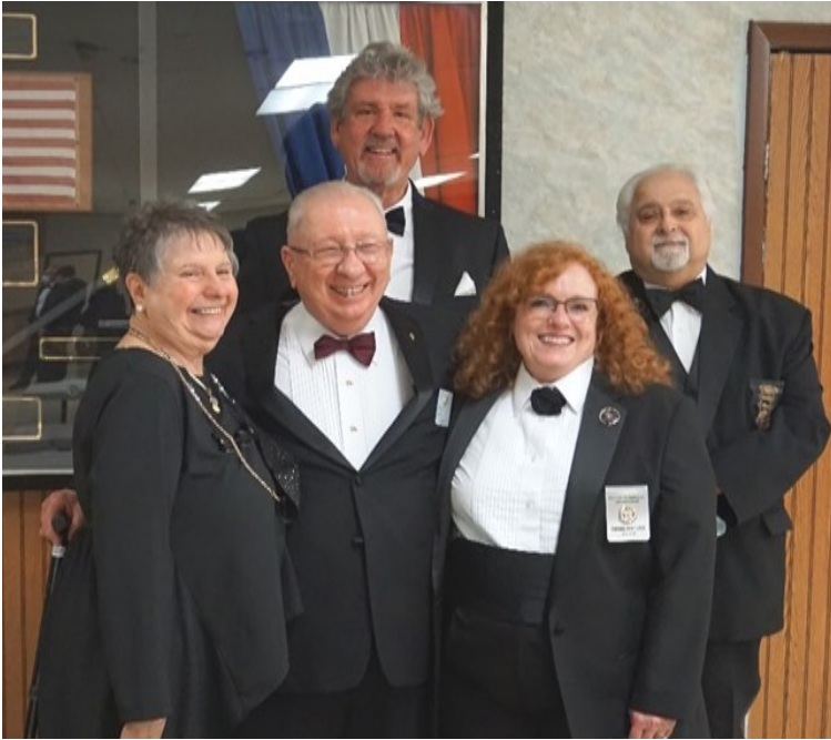
Pictured above Guest PERs:

We had our first in-person meeting since March 2020, when restrictions began, to install the 2021 officers on April 26, 2021. Lately, we have been able to meet in small crowds, but with caution. All CDC guidelines are being followed. The Camp Springs Elks Lodge would like to extend our appreciation for our guest PERs who made this the prestigious ceremony it was meant to be.