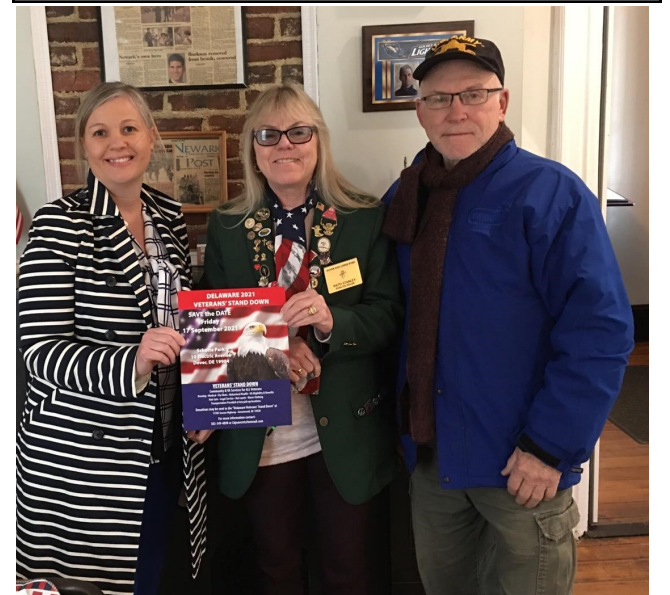
Dover Lodge #1903 presented a grant check for $750.00 toward the 2021 Veterans Stand down.