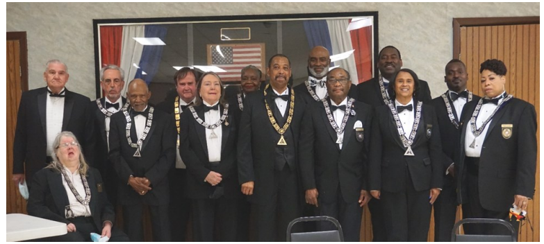
Camp Springs Elks Lodge #2332 ER and Officers: