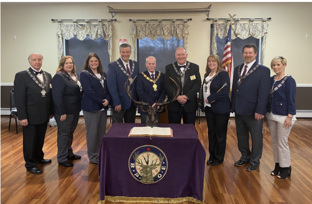
2021-2022 Officers of Westminster Lodge #2277