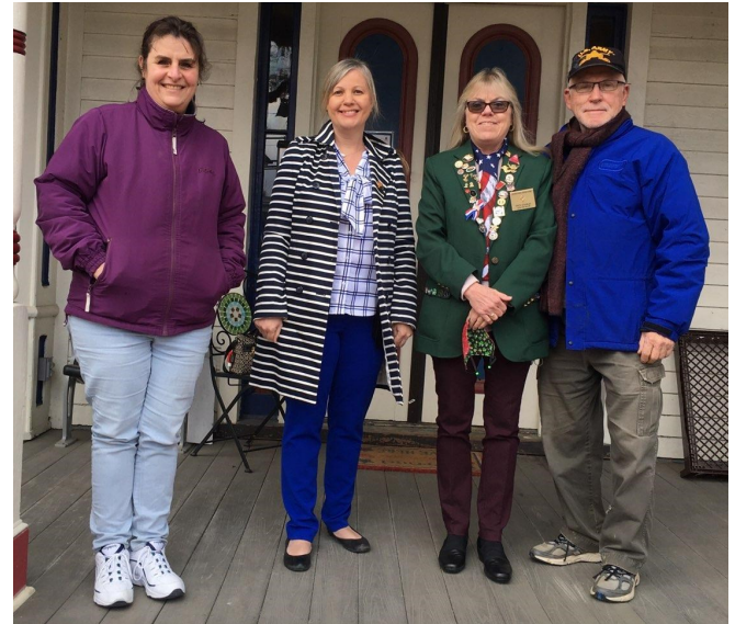
Dover Lodge #1903 presented Warriors helping Warriors in Middletown, DE with a grant check for $750.00 to help support a transition home for veterans.

Thank you all for your unwavering support throughout this challenging year!