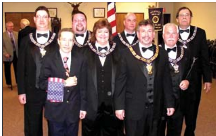
PRINCE GEORGE'S COUNTY LODGE #1778