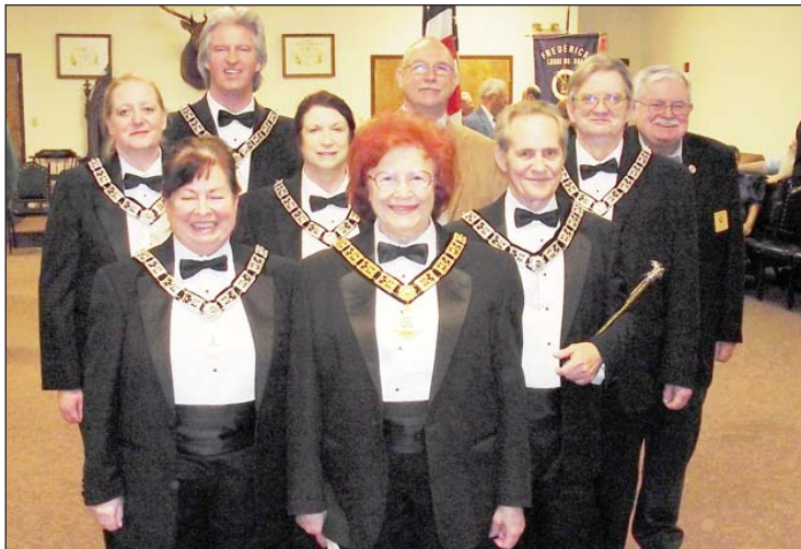
ANNAPOLIS LODGE #602