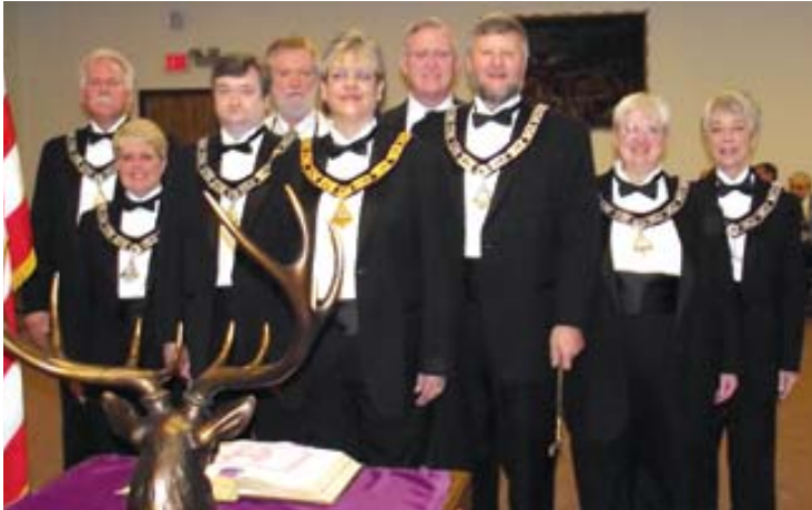
FREDERICK LODGE #684