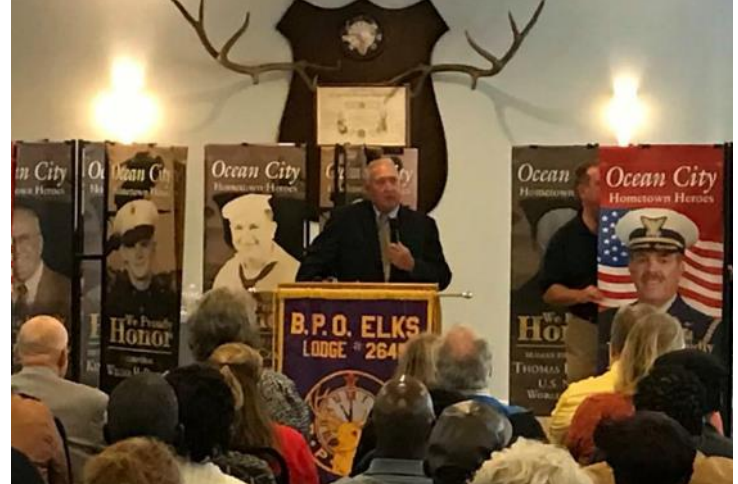
Ocean City Lodge Hometown Heroes Banner Presentation