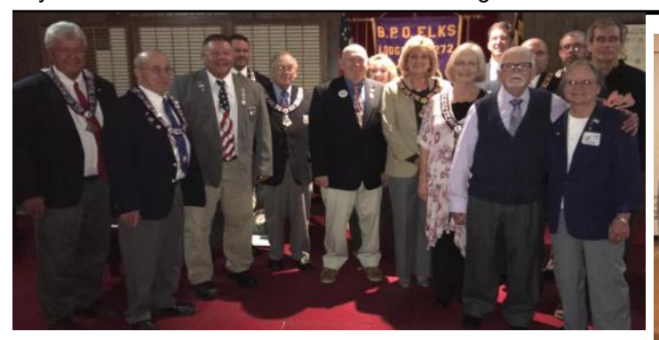
State President's Visit to Cambridge Lodge