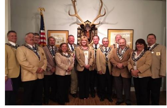
State President's Visit to Kent Island Lodge

1955 Crown Victoria displayed in the Ocean City Convention Center