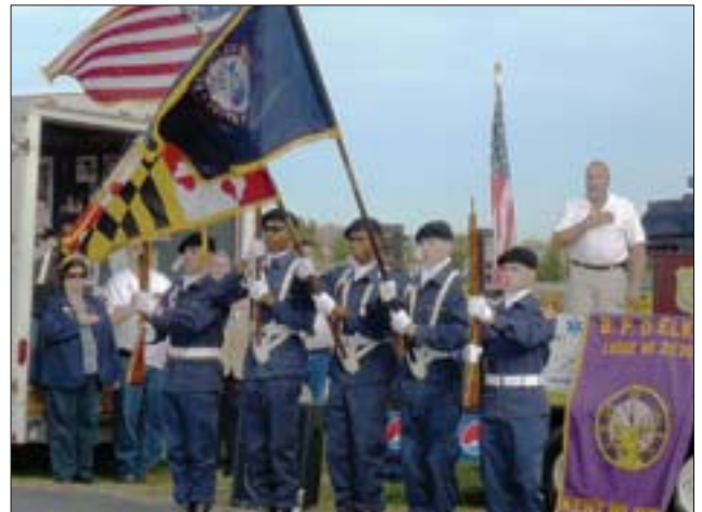
Free State Challenge Academy (Class #35) Color Guard and Drill Team