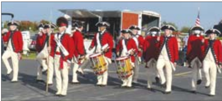
United States Old Guard Fife & Drum Corps