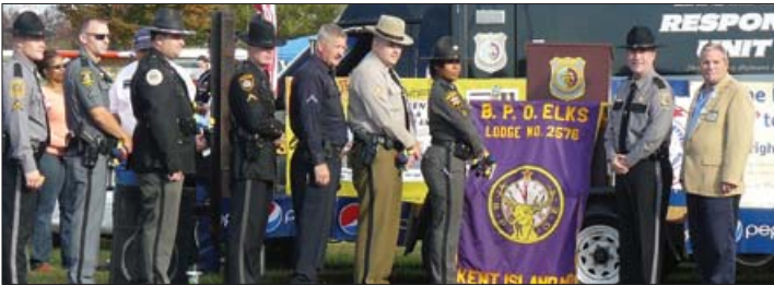
The National Enrique Camarena Award nominees are left to right: