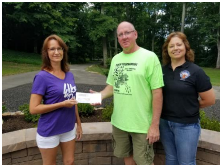
In August, St. Mary's County presented Boy Scout Troop #561 with a check for $1,000 along with Elk patches for their uni-