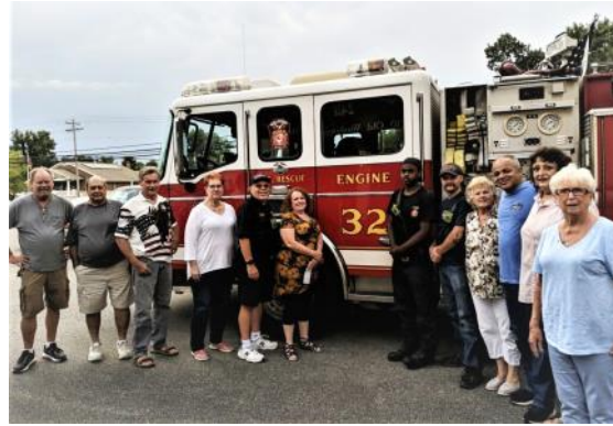
Three Waldorf Volunteer Fire Fighters joined Waldorf Lodge 2421 during a Wednesday Dinner on July 31st They presented them with A check for $1,000 from an Elks National Foundation Grant towards the purchase of a new fire truck.

We're sure everyone had a memorable time. The food was delicious, the music was jamming, and the atmosphere was festive.