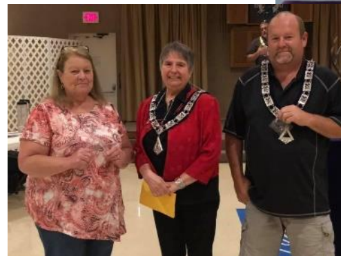
from National Convention for their contributions to ENF.

Waldorf Lodge members assisted a local soup kitchen on July 23 rd . They