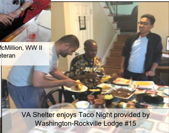
VA Shelter enjoys Taco Night provided by Washington-Rockville Lodge #15