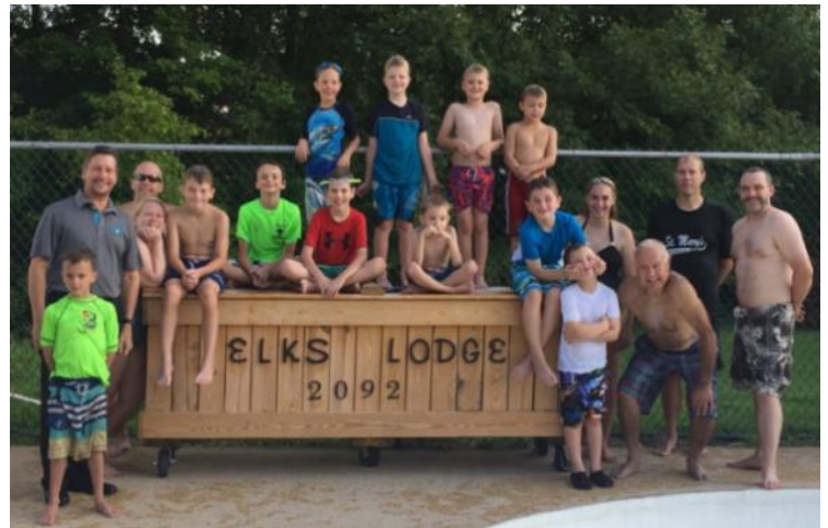
Cub Scout Pack #1787 (sponsored by St. Mary's County Lodge) enjoyed their Annual Pool Party at the Lodge.

Other Lodges in our district have also been busy. So busy I had to find their activities on their Facebook pages.