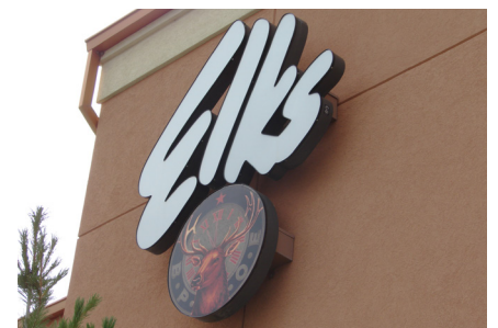
Elks sign on the exterior of Provo, UT Lodge No. 849.

The secretary shall advise the unaffiliated Member in writing of the date of their being dropped from the rolls and of their right to re-affiliate within (60) days. The reinstatement shall not result in the loss of continuous and consecutive membership standing. The 60-day reinstatement letter and mail merge option can be found on CLMS2 PC.