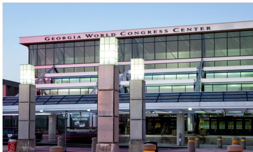
The 2022 Grand Lodge Convention will be held at the Georgia World Congress Center in downtown Atlanta.

The budget allocates $1.4 million to the Hoop Shoot, an increase for the national program's 50th anniversary. The Drug Awareness Program received $1 million, including a $225,000 grant from the DEA. The ENF also granted $10.4 million to Elks State Associations. Each year, the ENF strives to grant more money back to each state than it received from that state in donations.