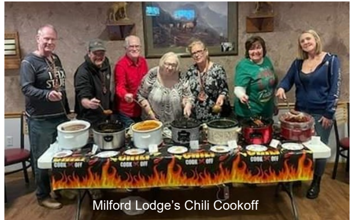
Milford Lodge's Chili Cookoff

Milford Lodge #1589 has been busy with line dancing each month. They had a Mardi Gras party with Trivia on February 10th. They are hosting a Night of Comedy fundraiser on April 27th. Also a Paint Party was held on March 3rd and then a Craft Show on March 9th. They have a lot of live music and are having an 80's party night. On February 17th, they hosted a Chili Cookoff. They continue to have recycled bottles and can drive each month.