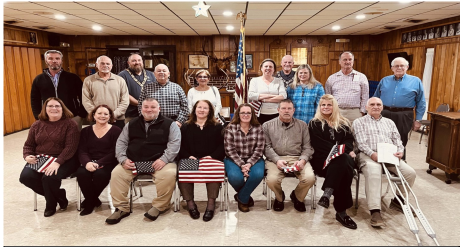
Above: Selbyville Lodge #2173 started the year off right by initiating their largest group in many years. There were 16 new members!

Cape Henlopen Lodge #2540 Cape Henlopen Lodge #2540 donated about 250 pounds of food and other requested essentials to the Community Resource Center (CRC) in Rehoboth Beach, Delaware. The Lodge also received a $2,000 grant from ENF. The money was presented to the CRC and will be used for their