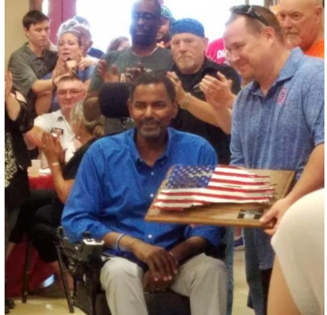
The "Faces of Valor" event is held each year to honor a military person or 1st responder who has been injured in the line of duty.