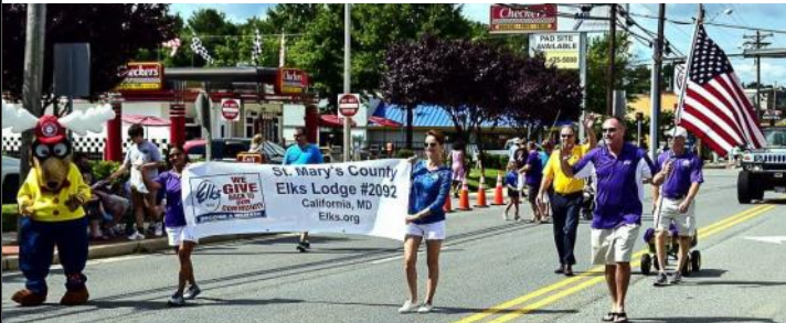
On August 25th, the lodge participated in a parade to celebrate our local Fire Department and Rescue Squad's 75th Anniversary.