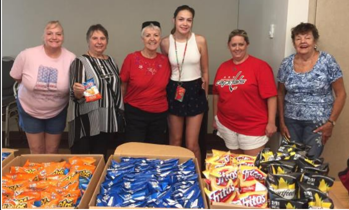
Beacon Grant used for Camp C.O.P.S.