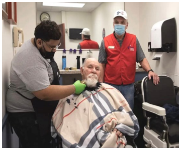
Newark Lodge #2281 arranged haircuts for vets at the Community Living Center (CCL), Wilmington VA Hospital.

April 23rd I will be holding the VP Caucus during the DD Clinic for North East VP, State Trustee, and Camp Barrett Executive Board positions at Havre de Grace Lodge #1564.