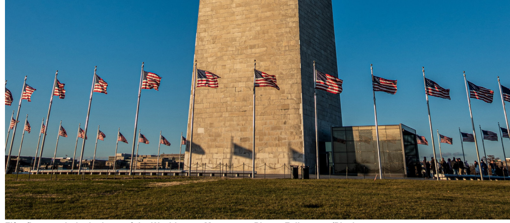
Fifty flags encircle the base of the Washington Monument.

• Fifty flags fly 24 hours a day around the Washington Monument.