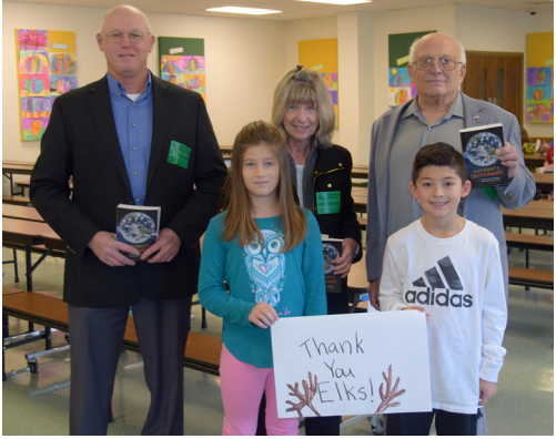
Students thank Vestal, NY Lodge No. 2508 for donating dictionaries.

More than 100,000 new Members are projected to be added to the rolls this fraternal year.