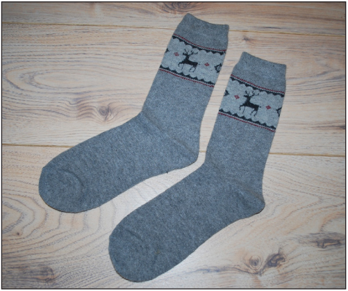
Instead of socks, give a loved one a symbolic gift to the ENF this holiday season. A donation to an ENF program can make a difference in someone's life.

A 501(c)(3) public charity, the Elks National Foundation helps Elks build stronger communities through programs that support