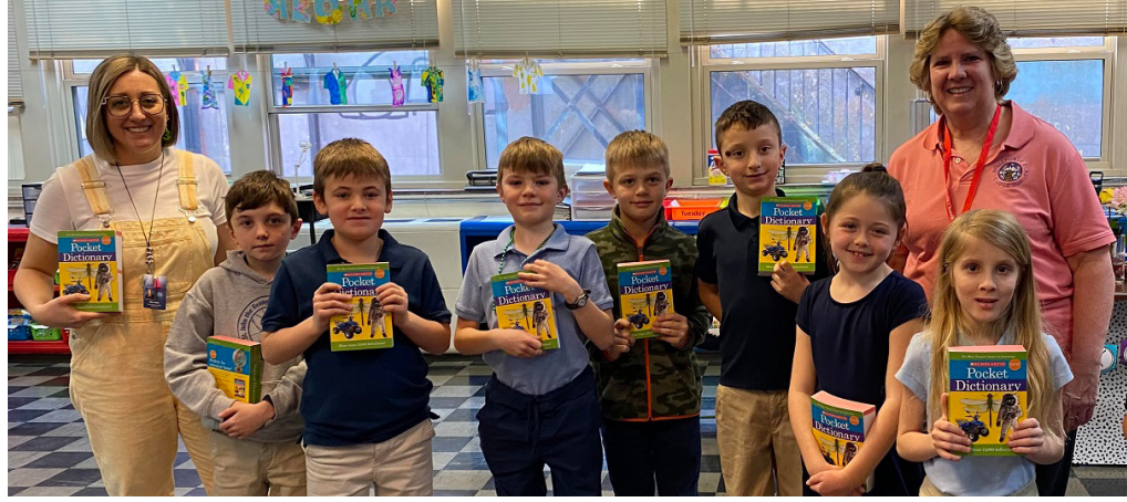
Bellefonte, PA Lodge No. 1094 provided dictionaries to local students.

Some positive things to remember with the Dictionary Project are that we are providing a source of knowledge to kids who may not have the ability to research things online when they are at home. Not every household has access to the internet, but by providing these kids with a dictionary, we are giving them an opportunity to still learn. This dictionary is theirs to keep, and I haven't found one child who doesn't enjoy getting a book. In some instances, this is the first book they have ever received.