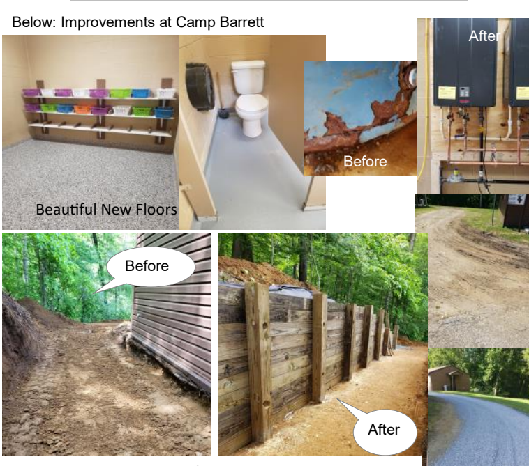
Below: Landscaping install for the leaky art shack at Camp Barrett. Thanks Windsor Electric and Camp Sunrise.