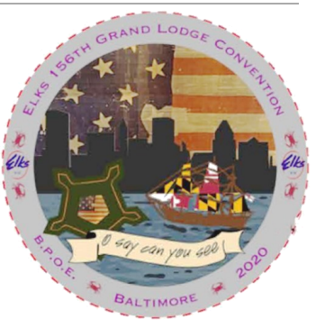
Connie Frere Pin Design Kent Island Lodge