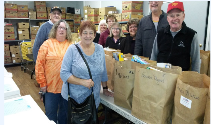
Members of Dover Lodge #1903 prepared holiday meal bags for 20 needy families for Thanksgiving and Christmas, thanks to a Gratitude Grant.

IT'S THE FUTURE OF YOUR LODGE. We as the great Elks, need all the best and I believe it starts with "you," great Elks. There is a verse I would like to share, "If you get out there and you're liked, others will want to be like you." I have heard someone likes that too. With that said, I will be looking forward to seeing everyone in the future of my travels in Elkdom. Have a safe and happy journey.