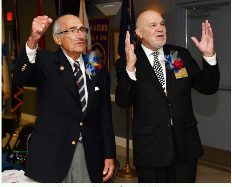
Veterans Day at Cape Henlopen

Veterans receiving banner from Hometown Hero's Boardwalk display— Ocean City Lodge