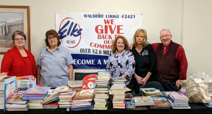
Waldorf Lodge #2421 Baby Shower