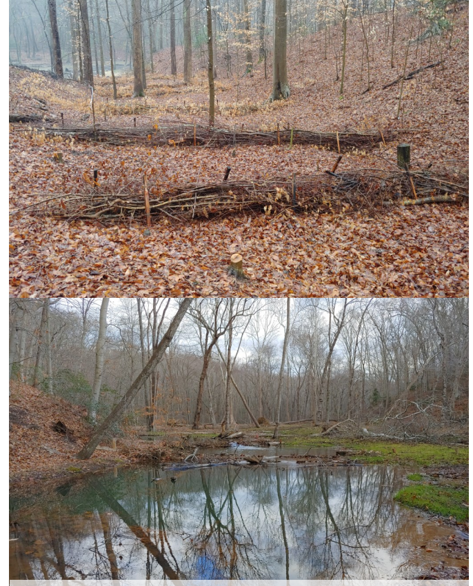
This is the stream taken from near where the new footbridge will go, looking upstream to the left from the bottom of the hill.

*This week ECB welcomes Co-Ed Campers who are age 13 through 15. Along with our traditional camp programs this week our camp program will include leadership, and inspirational programming provided by local churches, business leaders, sports figures and faith-based organizations.