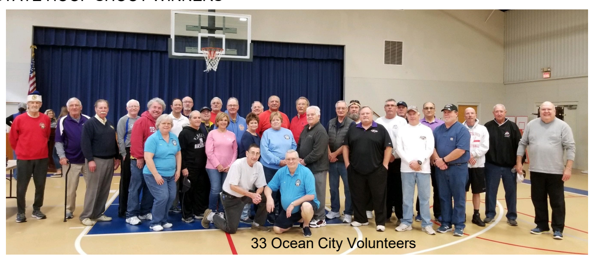
STATE HOOP SHOOT WINNERS