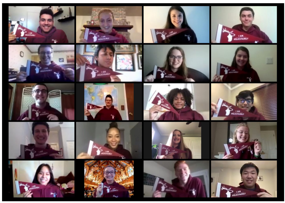
This year's Top 20 Most Valuable Student finalists participated in a video conference meeting

Before the weekend ended, the scholars shared their favorite moments of the virtual programming, and what would stick with them the most.