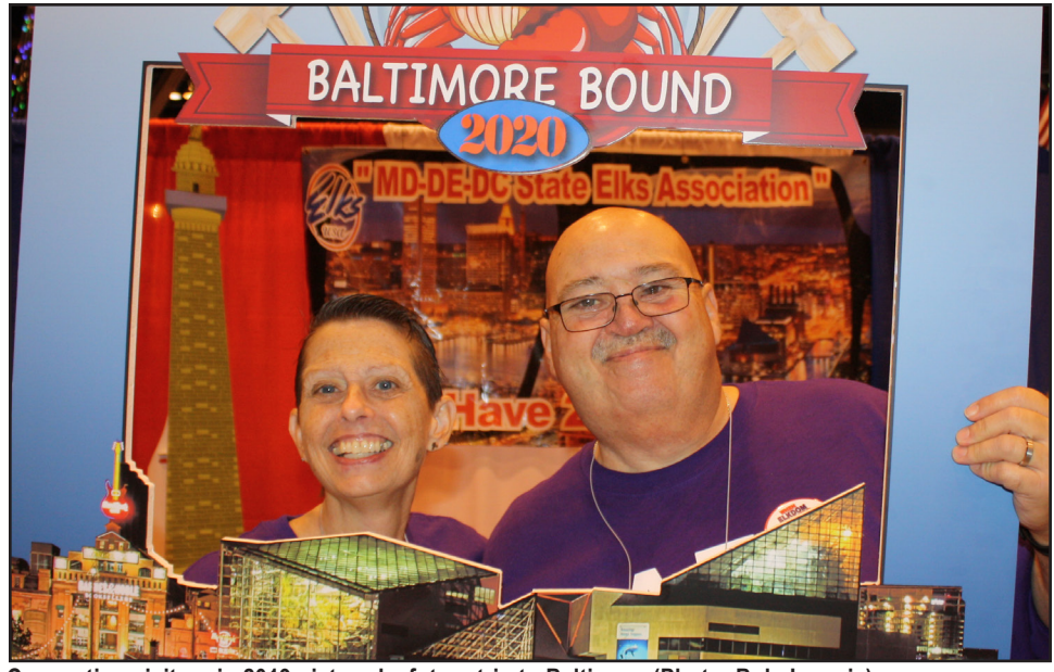
Convention visitors in 2019 pictured a future trip to Baltimore

"Elks do great things in their community through charity, but to me the most important thing I get from being an Elk is that sense of community the organization itself