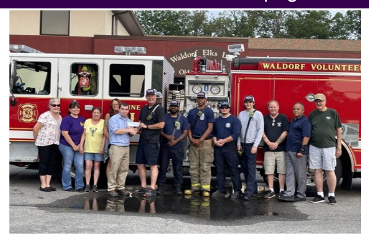
Waldorf Lodge donated funds from the ENF Gratitude Grant to the Waldorf Volunteer Fire Department.