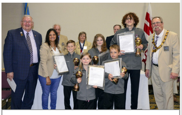
20-21 NATIONAL SOCKER SHOOT WINNERS

Soccer Shoot at your local Lodge. You can even team up with another Lodge and host together. Check with your District Chairs to be sure you have your local shoot before the District Shoot.