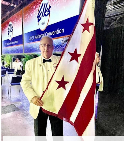
Proudly carrying the Washington DC flag at the National Convention in Tampa, FL

Located on the left sidebar is the Main Explore the wealth of information on our explore the GL Website: Elks.org / Join.Elks.org (it has a Pre-Application signup form for potential New Members) or https://virtualmanuals.elks.org/. You will find the New Membership and Marketing Guides here.