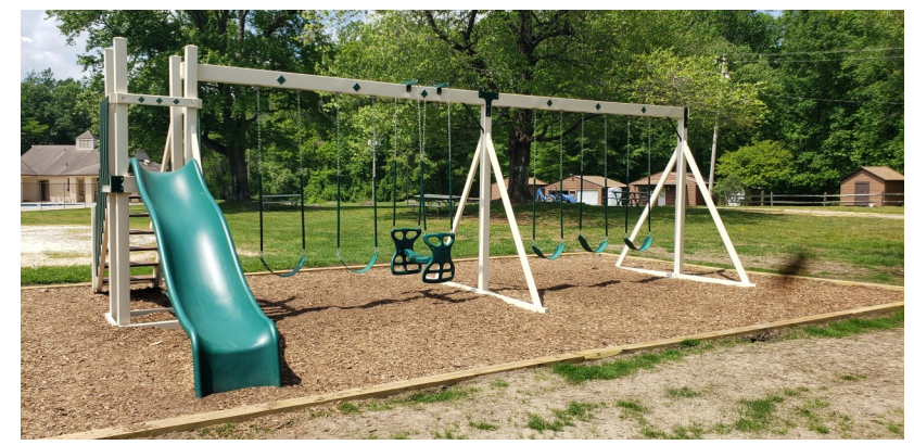
Elks Camp Barrett's beautiful new playground