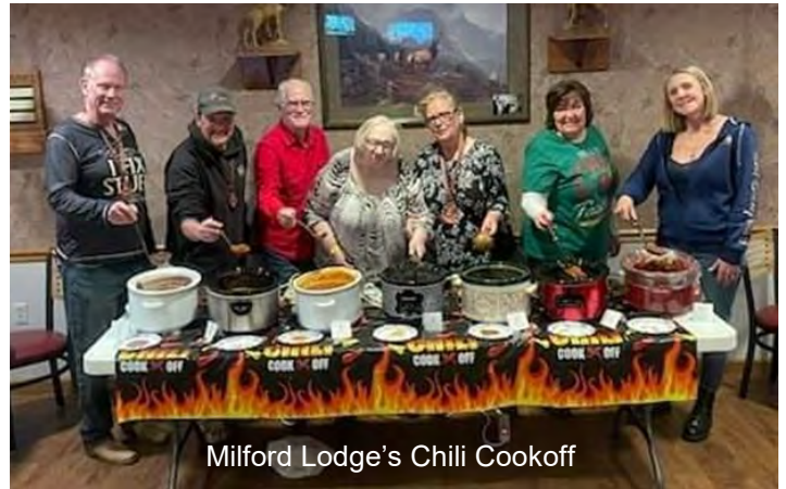
Milford Lodge's Chili Cookoff

Milford Lodge #1589 has been busy with line dancing each month. They had a Mardi Gras party with Trivia on February 10th. They are hosting a Night of Comedy fundraiser on April 27th. Also a Paint Party was held on March 3rd and then a Craft Show on March 9th. They have a lot of live music and are having an 80's party night. On February 17th, they hosted a Chili Cookoff. They continue to have recycled bottles and can drive each month.