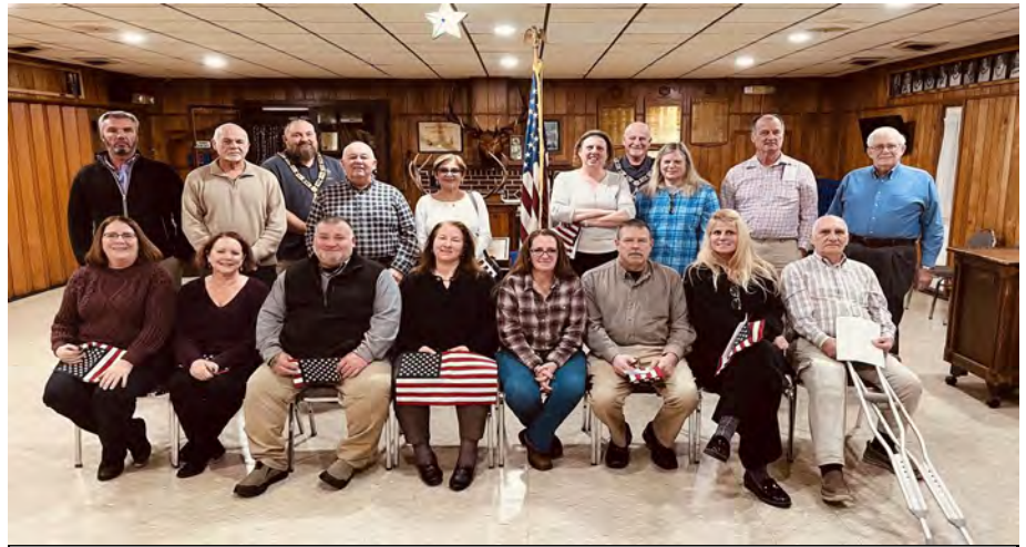
Above: Selbyville Lodge #2173 started the year off right by initiating their largest group in many years. There were 16 new members!

Cape Henlopen Lodge #2540 Cape Henlopen Lodge #2540 donated about 250 pounds of food and other requested essentials to the Community Resource Center (CRC) in Rehoboth Beach, Delaware. The Lodge also received a $2,000 grant from ENF. The money was presented to the CRC and will be used for their