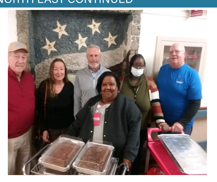
Wilmington Lodge #307 delivering Thanksgiving Dinner to Elsmere Hospital workers.