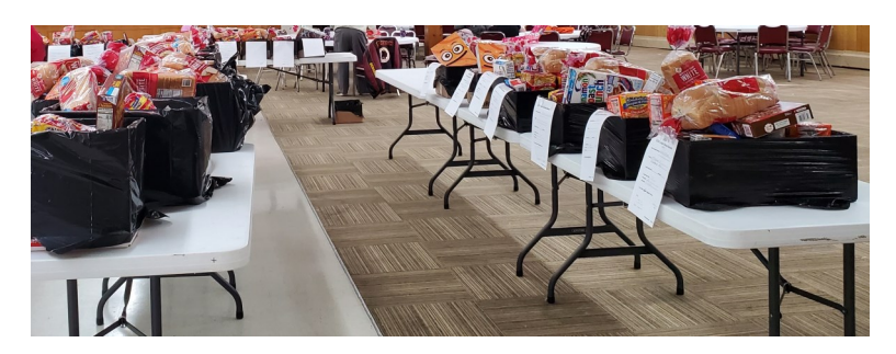
Submitted by Deb Davies Sprecher, Leading Knight

The many gift baskets are pictured below: