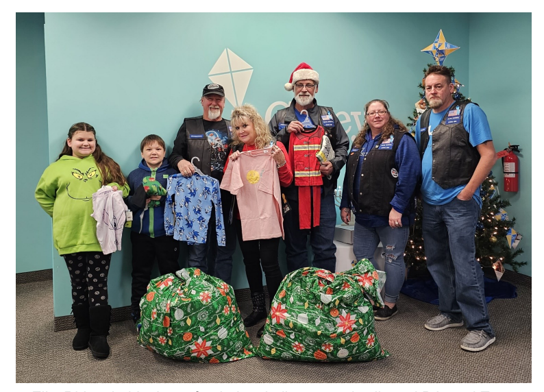
Elks Riders held a large fundraiser bull roast and collected PJs and Toys