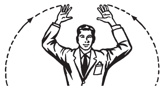
The Hailing Sign