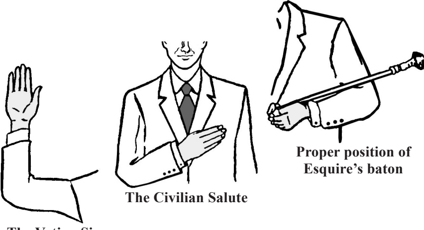
The Voting Sign