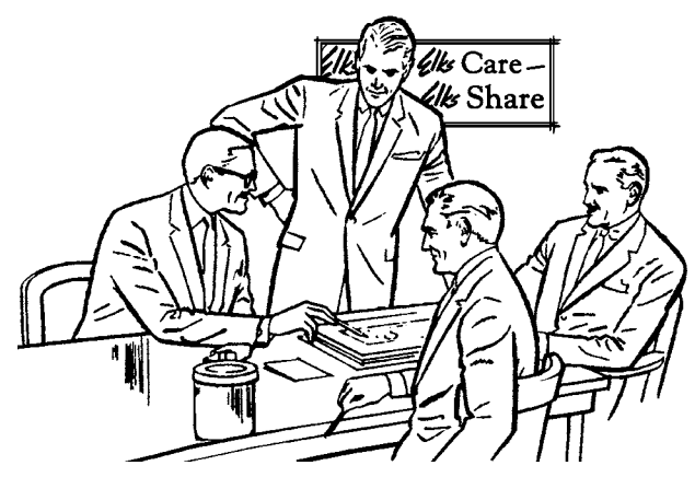
produce just what the Lodge needs—a successful program. If the person accepts the task of chairing a committee, let the person do it. (See Appendix C—page 14.)

A well-planned and scheduled program cannot be accomplished without the dedicated leadership of a knowledgeable committee and, particularly, a good Chairperson. How is a good person found to chair a committee? Find a member with (1) proven past performance; (2) enthusiasm for the task; and (3) ability to bring together other enthusiastic, cooperative people. Give the person the responsibility and authority and then let the person do the job. The person will very likely